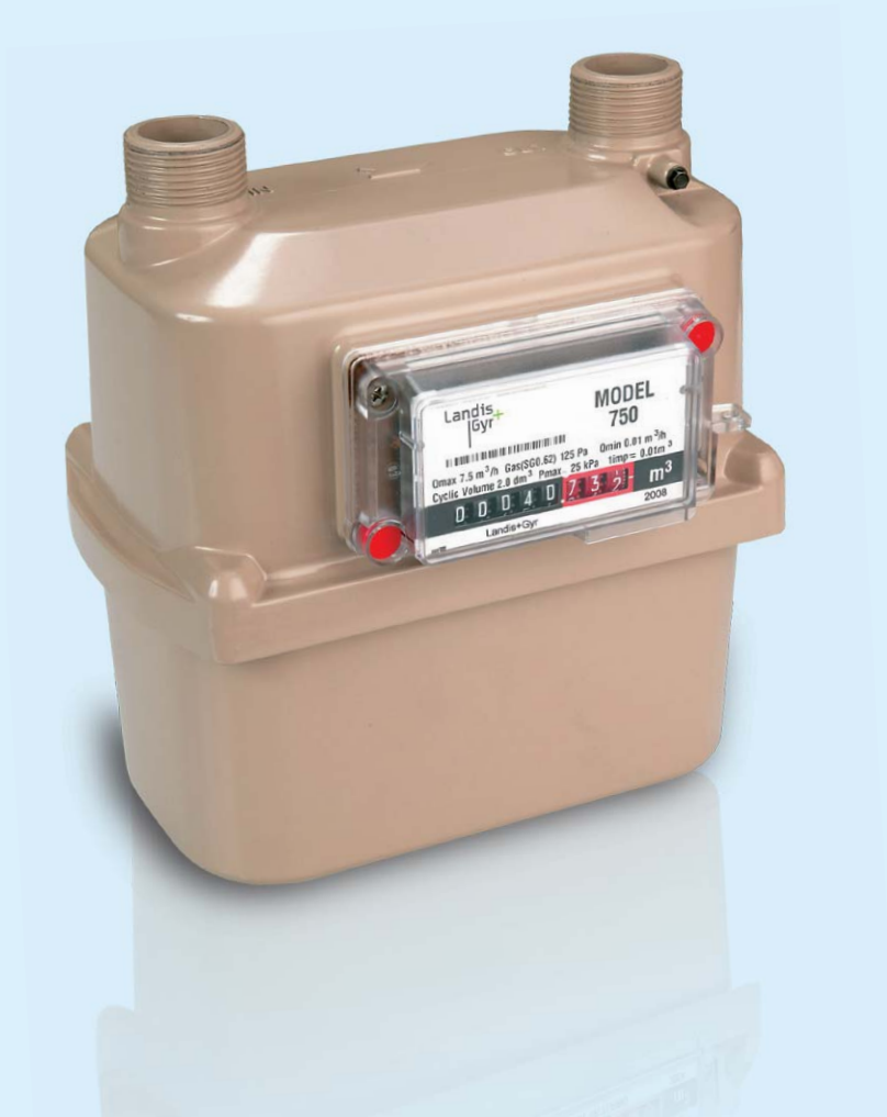
Model 750 High Capacity Gas Meter